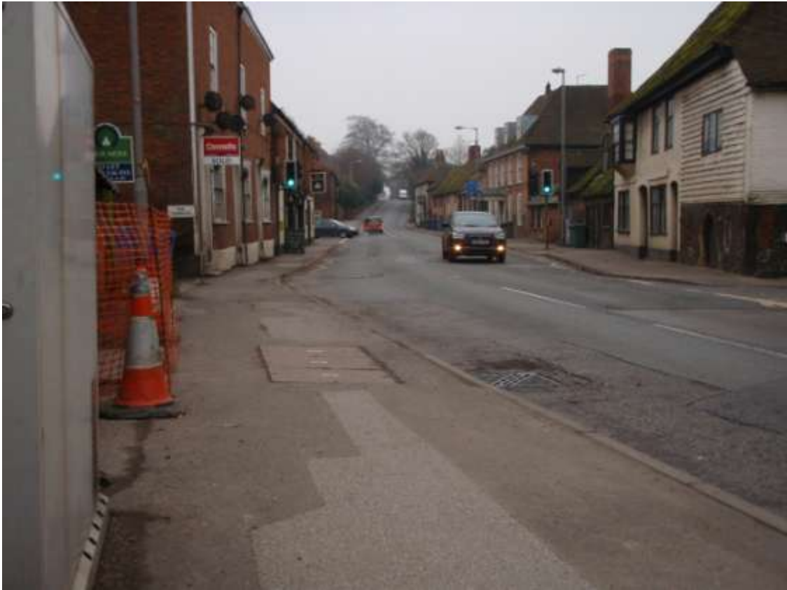
Plate 8. View from sniper aperture (looking E along the A2)