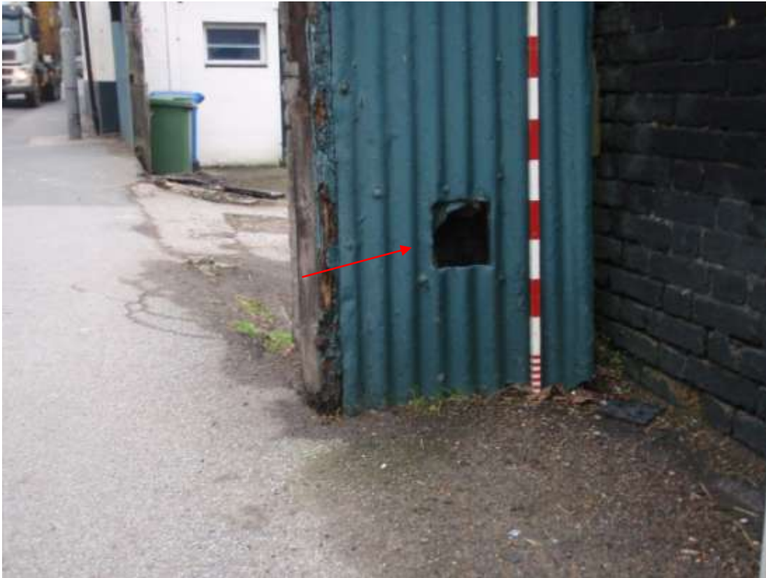
Plate 3. Close-up of sniper position (looking W)