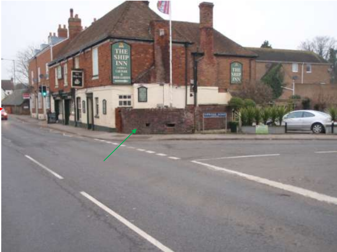
Plate 1. View of sniper position (red arrow) and pillbox (green arrow) looking NW