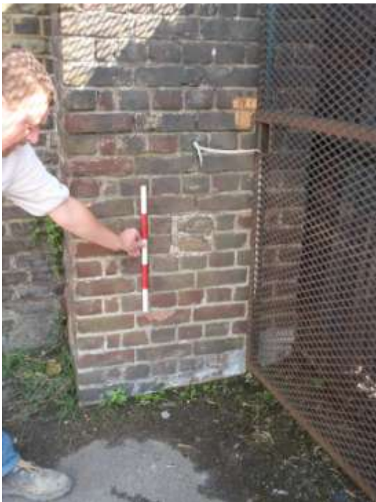
Plate 7. Internal cut of sniper aperture