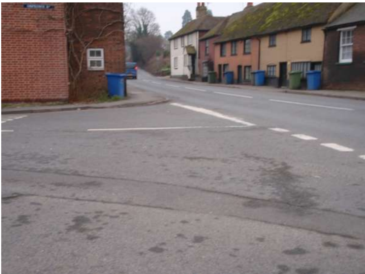
Plate 13. View from aperture of pillbox (looking E)