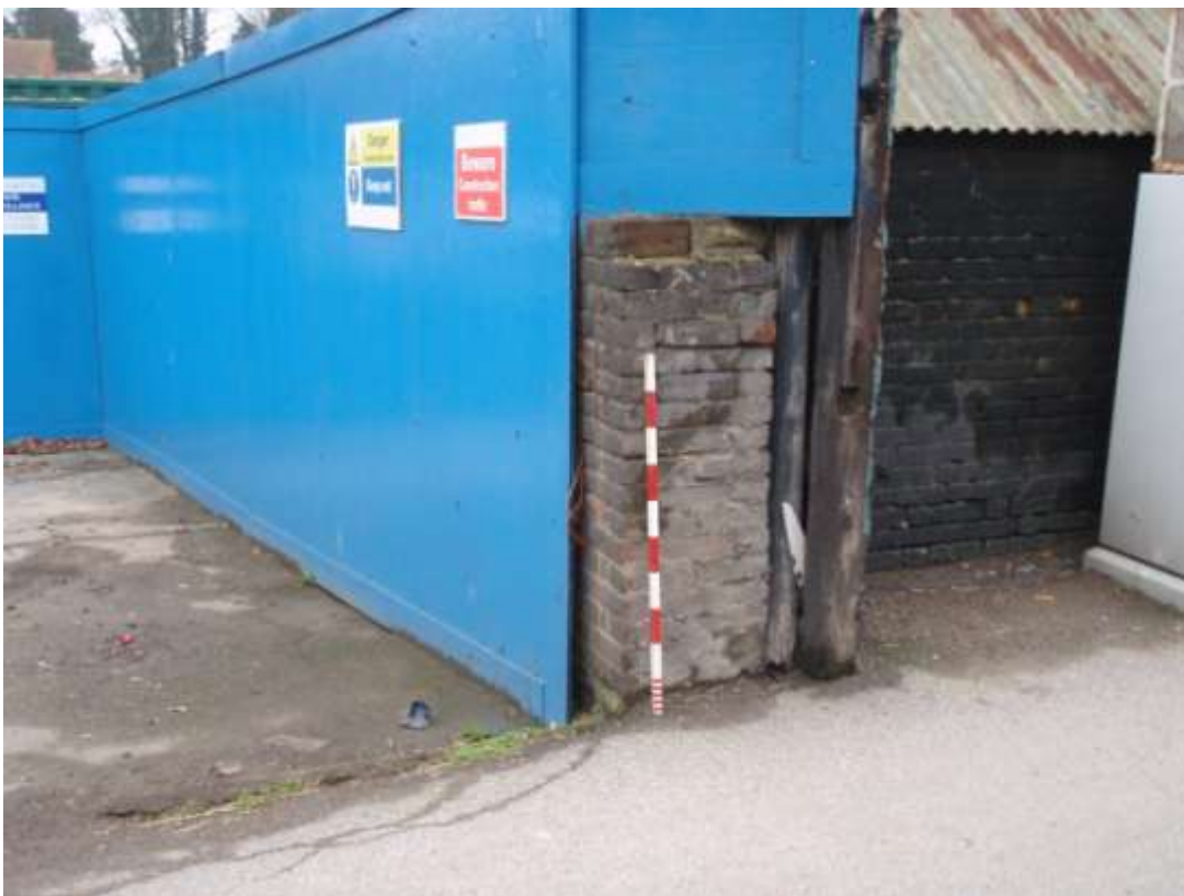
Plate 4. View of brick structure of sniper position (looking N)