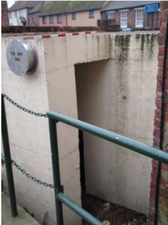
Plate 12. Rear entrance to pillbox