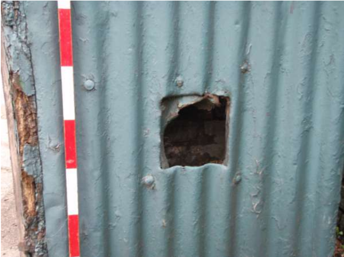
Plate 5. Close-up view of sniper aperture