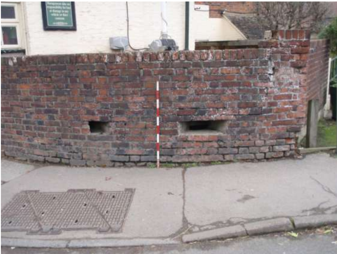
Plate 11. Close-up of pillbox