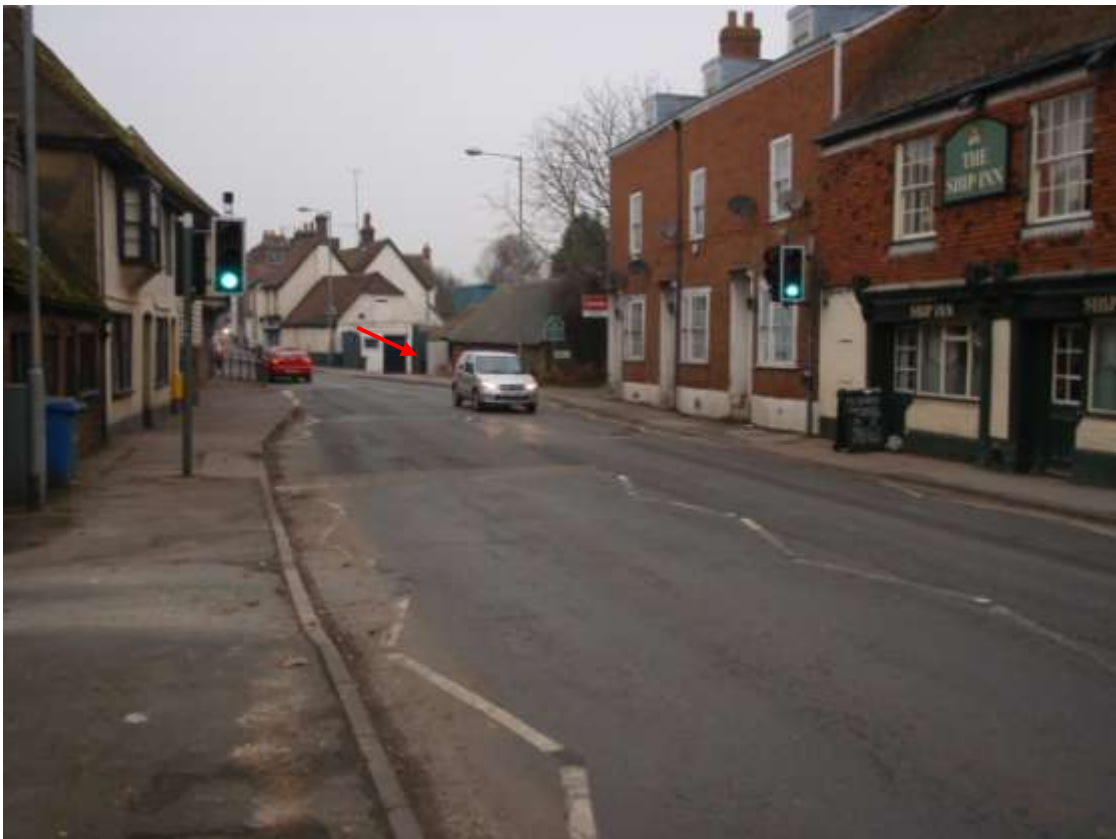
Plate 9. View towards sniper position (looking W)