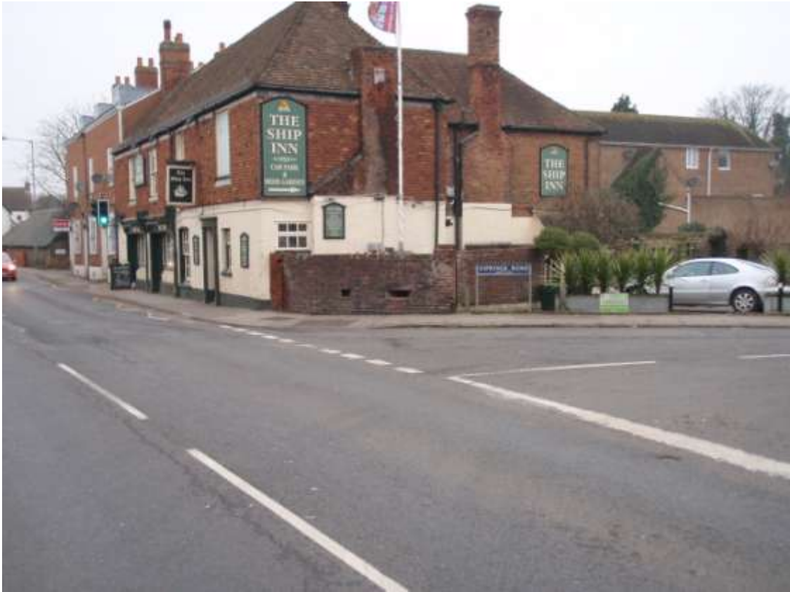
Plate 10. View of pillbox TR 06 SW 1177 (looking NNW)