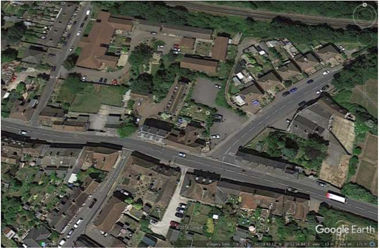
Plate 14. 2013 aerial view of site