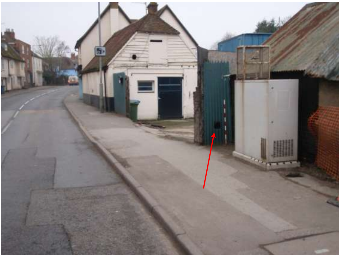
Plate 2. View of sniper position (red arrow) looking W